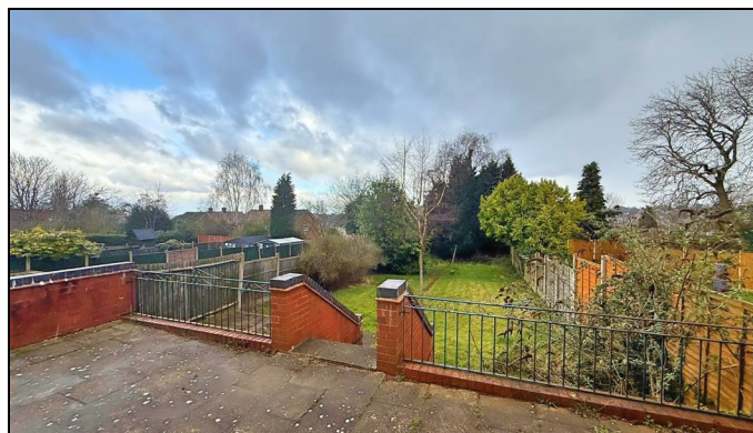
Blackberry Lane, Four Oaks